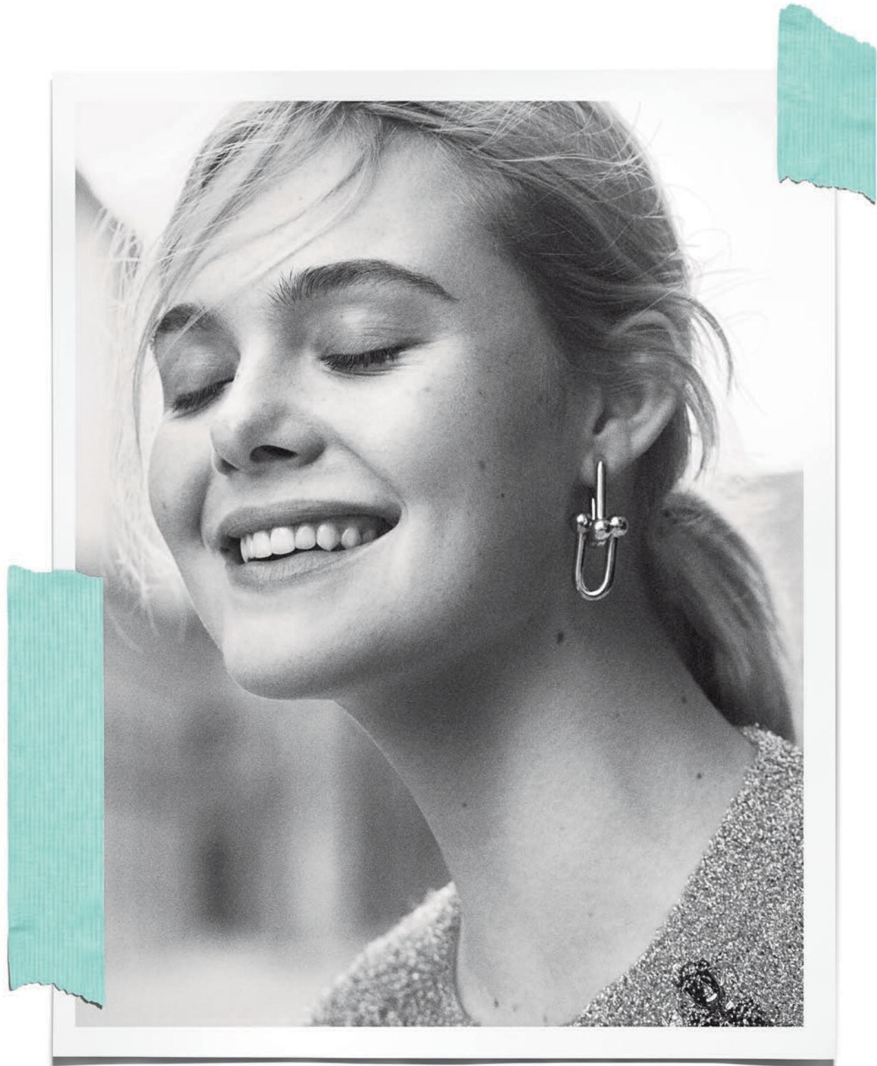
Previous spread: Tiffany Paper Flowers designs in platinum with diamonds. This spread: Tiffany HardWear and Ziegfeld designs. Clasp link bracelet.