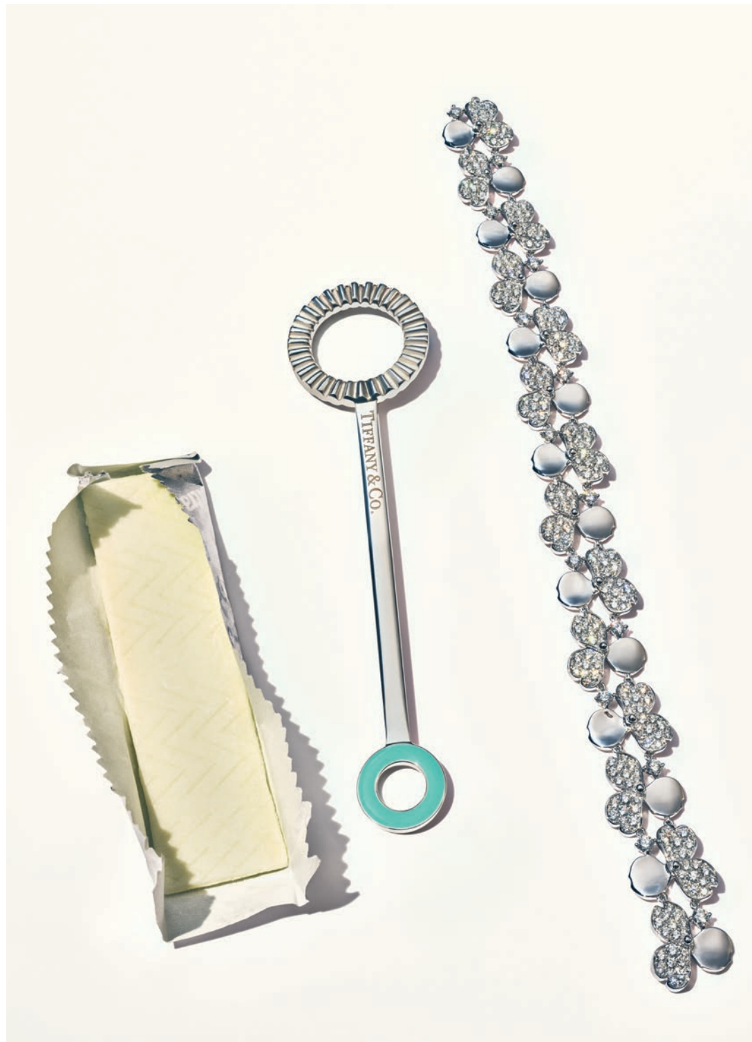
Previous spread: Flora & Fauna designs in crystal. Sterling silver paper plate. Diamond Point designs. Tiffany Color Splash designs. This page: Sterling silver bubble blower. Tiffany Paper Flowers bracelet in platinum with diamonds. Opposite page: Fishbowl in mouth-blown glass.