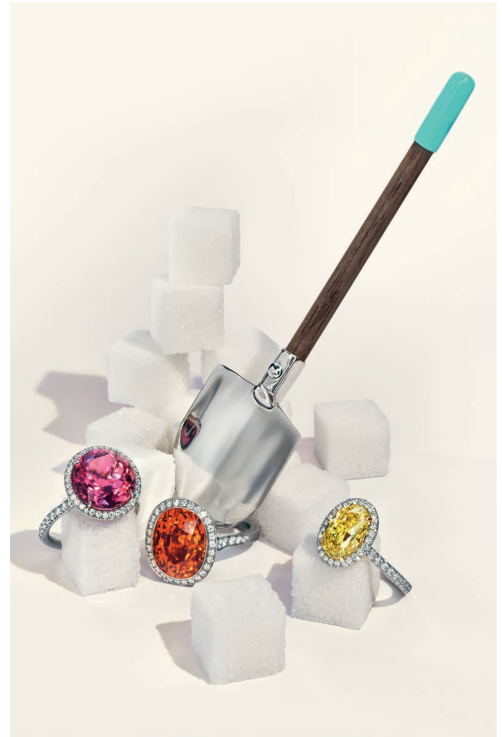
Previous spread: Tiffany Paper Flowers ring in platinum with diamonds. This spread: Tiffany Blue line three-piece set in bone china. Earrings in platinum with diamonds. Sterling silver sugar shovel with American walnut. Rings in platinum with gemstones and diamonds, from left: pink tourmaline, spessartite and Fancy Vivid Yellow diamond. Select Home & Accessories products featured in this story, launching summer 2018. Tiffany Paper Flowers will be available in select markets this summer and worldwide September 1. For more information, please contact Customer Service or visit Tiffany.com .