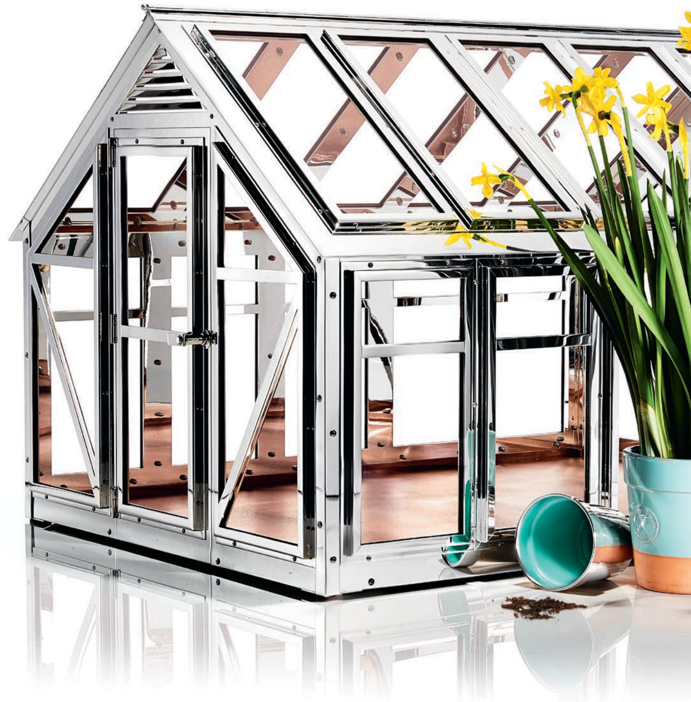
Sterling silver greenhouse with copper and glass.

Four female artists transform our greenhouse, creating a new world with their extraordinary vision. Elevating form and redefining function produces mesmerizing results.