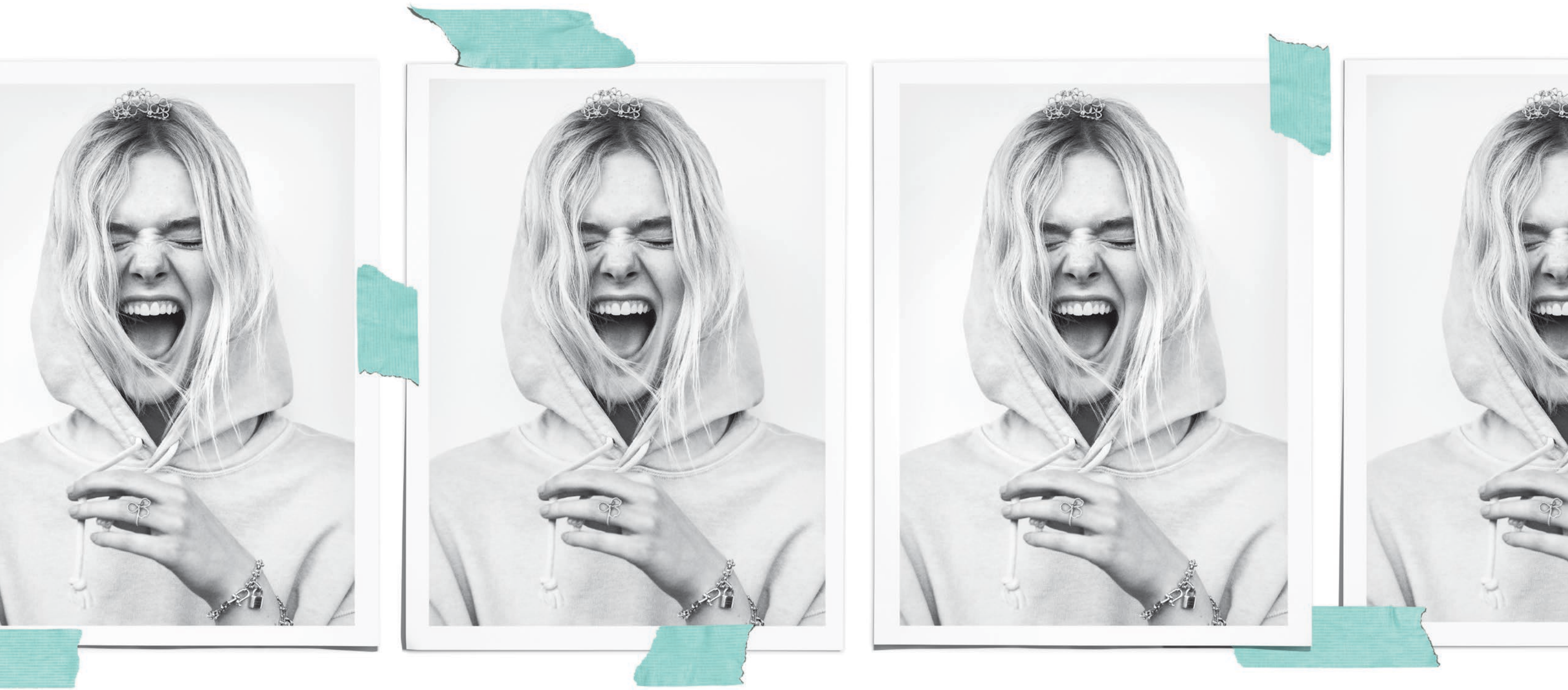
Previous two spreads: Tiffany Paper Flowers designs in platinum with diamonds. This spread: Tiffany Paper Flowers and Tiffany HardWear designs. Tiffany Paper Flowers will be available in select markets this summer and worldwide September 1. For more information, please contact Customer Service or visit Tiffany.com .