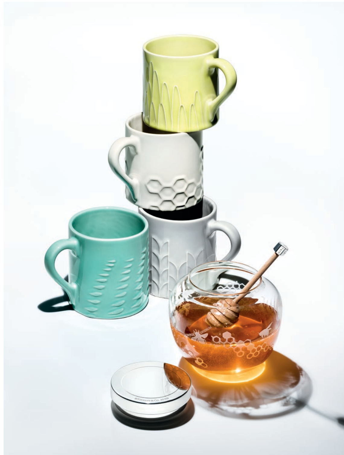
This page: Flora & Fauna designs. Opposite page: Gardening tote in canvas. Sterling silver iris watering can.