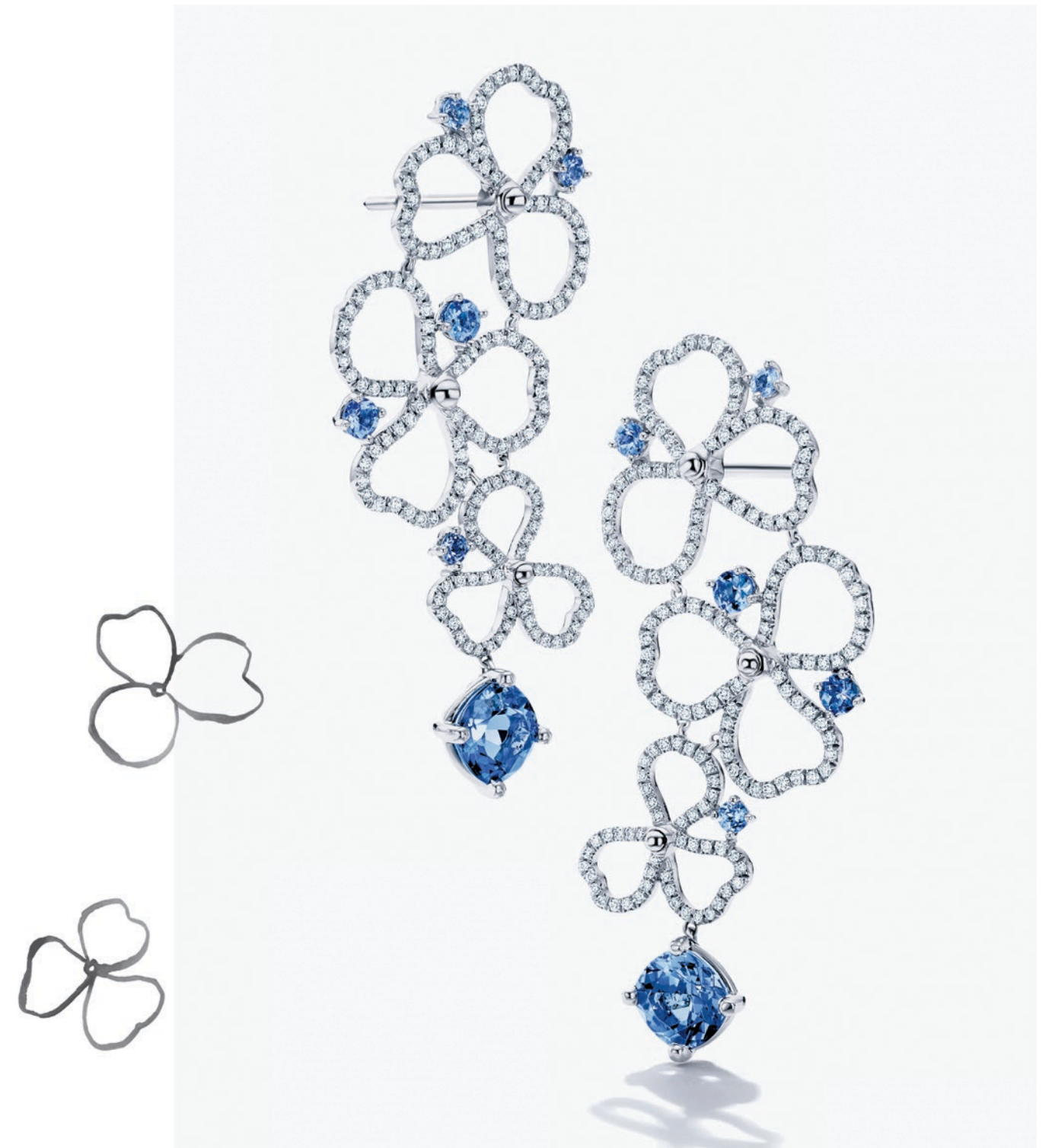
Tiffany Paper Flowers designs in platinum with diamonds and tanzanites.