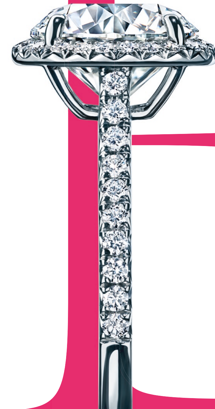
Tiffany Solette Round in platinum.