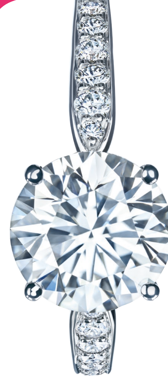
Tiffany Harmony™ in platinum with a bead-set band.