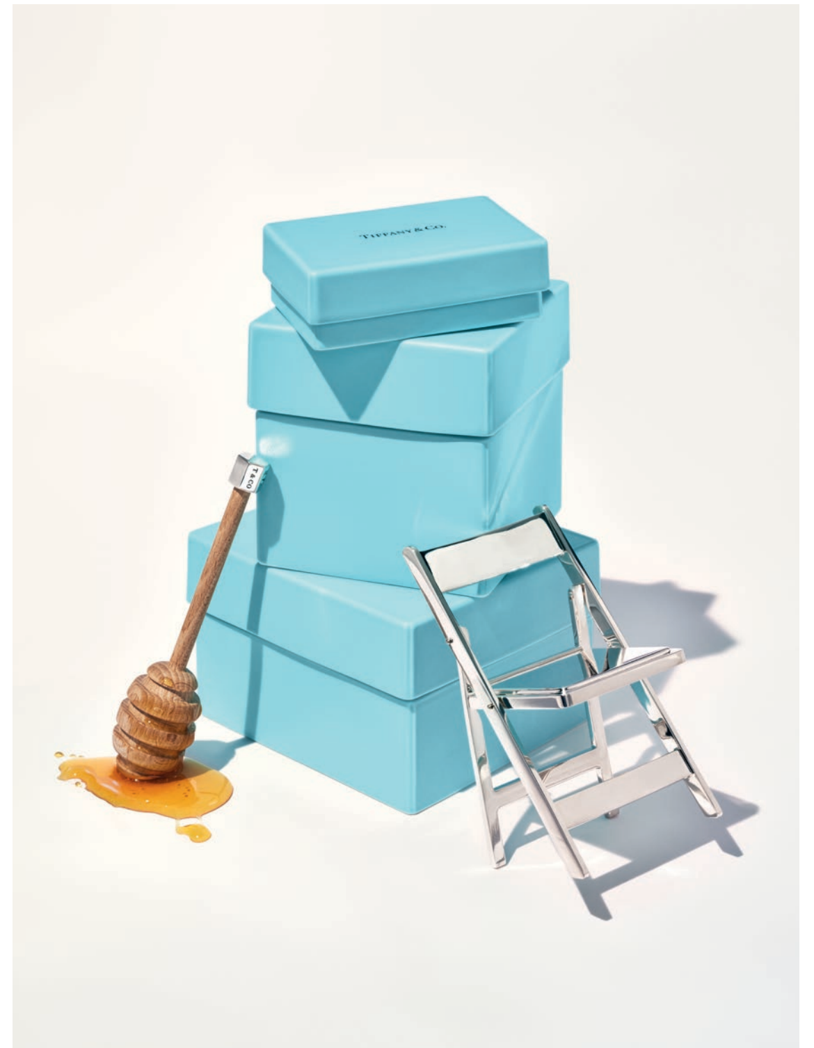
Opposite page: Sterling silver clothespin. Tiffany Paper Flowers necklace in platinum with diamonds and tanzanites. This page: Home & Accessories designs.