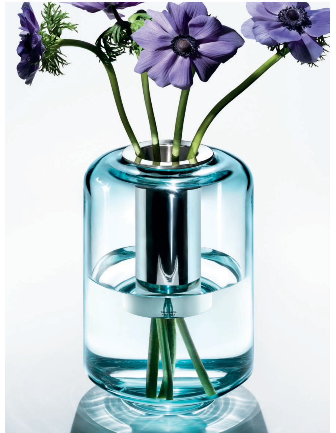
Previous page: Sterling silver flowerpots. Opposite page: Color Block weekend tote in canvas. Terra-cotta flowerpots. Handwoven sterling silver bird's nest with Tiffany Blue porcelain eggs. This page: Seguso Vetri D'Arte vase in glass and sterling silver. Select Home & Accessories products featured in this story, launching summer 2018.