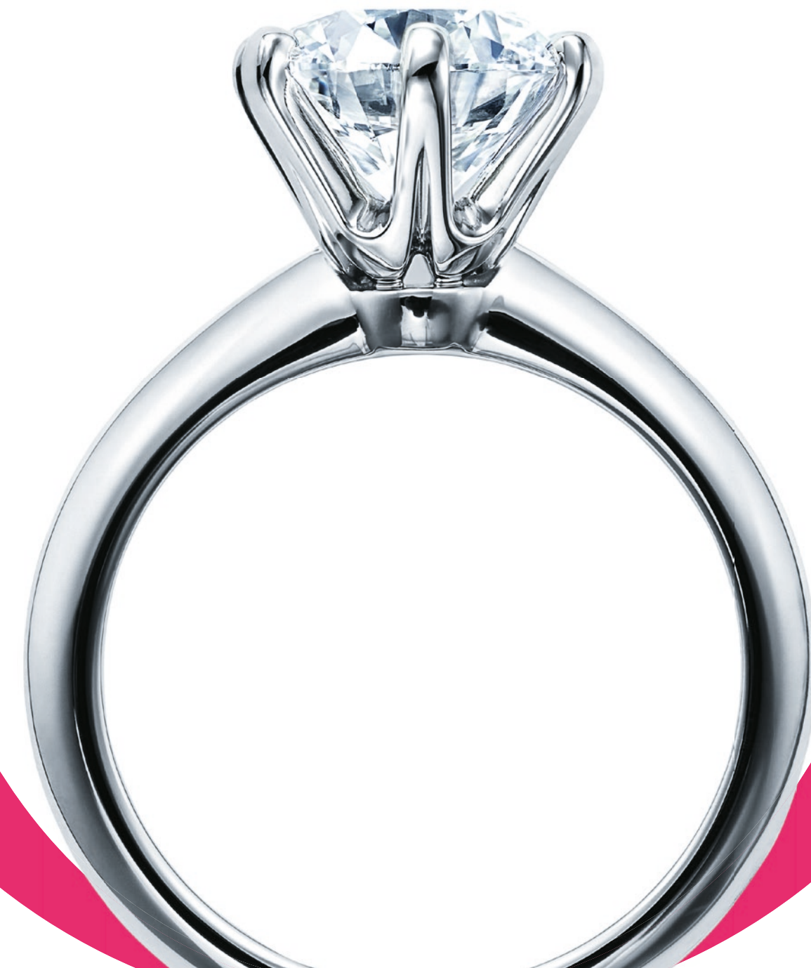
The Tiffany® Setting in platinum.