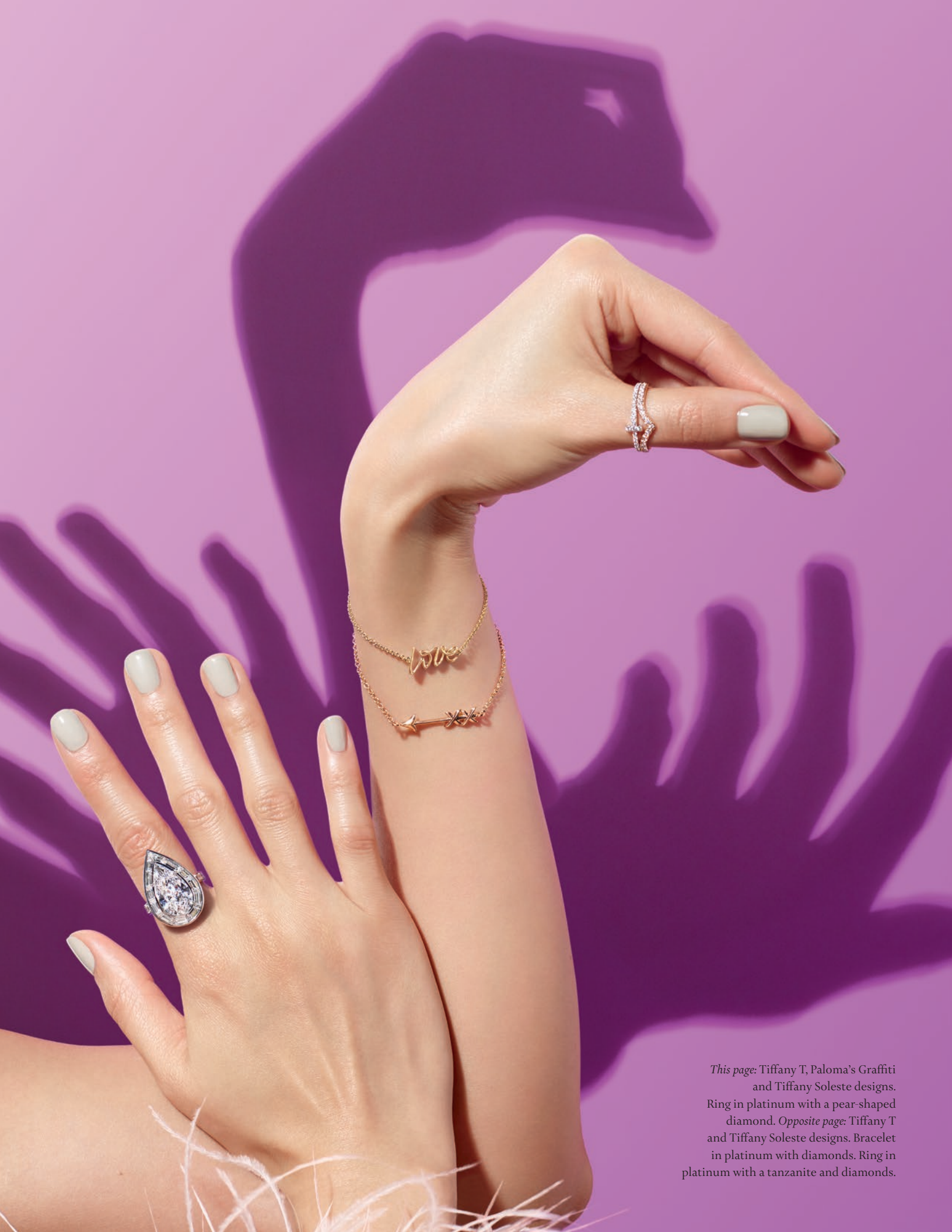
This page: Tiffany T, Paloma's Graffiti and Tiffany Soleste designs. Ring in platinum with a pear-shaped diamond. Opposite page: Tiffany T and Tiffany Soleste designs. Bracelet in platinum with diamonds. Ring in platinum with a tanzanite and diamonds.